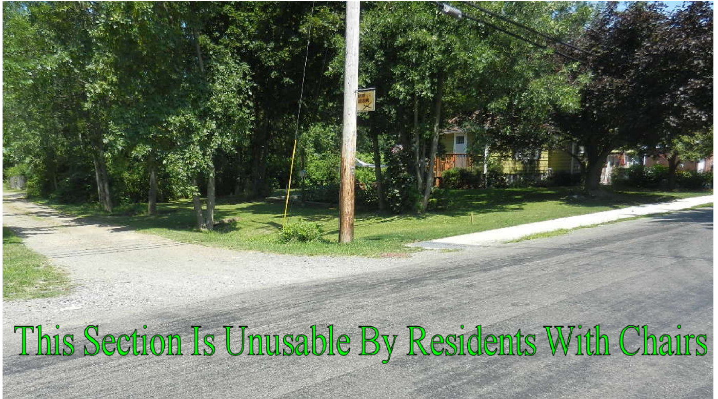
IMAGE BELOW SHOWS INACCESSIBLE PICNIC & PLAYGROUND AREA